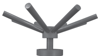
Z-style distributor shown mounted on blind flange.